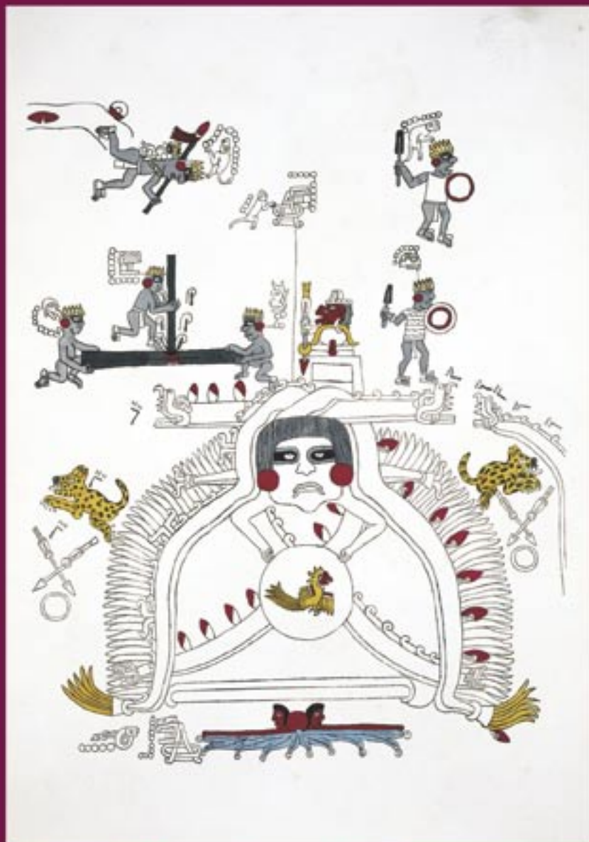
KINGSBOROUGH, Edward King. Antiquities of Mexico: comprising facsimiles of ancient Mexican paintings and hieroglyphics Robert Havell, Colnaghi Son & Co., London, , 1831. First edition.

One of the greatest illustrated works on Mexican antiquities